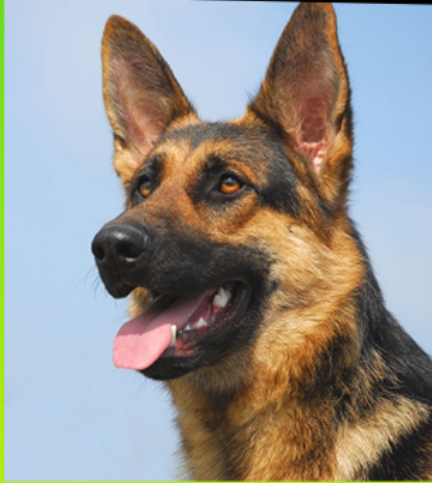
THE LEADER RANGER